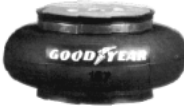
STOCK NO. GY00801 Single convolute-bellows sleeve type