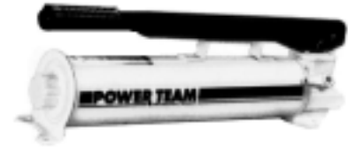
STOCK NO. OT00450 2 speed, 2-way valve