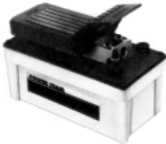
STOCK NO. OT00900 Single speed, 2-way valve