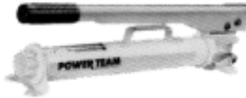
STOCK NO. OT00600 Single speed, 2-way valve