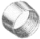
165 • TUBE SLEEVE Used with 205 Nut